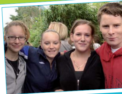
All enjoying the day out at Thorpe Park.

On Wednesday 22nd August, 7 young people travelled to Thorpe Park to meet the Children's Rights Director for England to give him their views on Bullying.