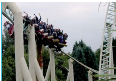
Just one of the many rides we went on!

Travelling the dizzy heights of Stealth and thundering around the steel tracks of Colossus our seven little adrenalin junkies were not put off by the wind and rain, and delighted in the ultimate feat of the gravity defying rides. Impressive some might say!