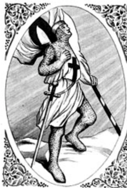
Image taken from a New Year's card issued by the Crusaders' Bible Class, Battersea, 1917