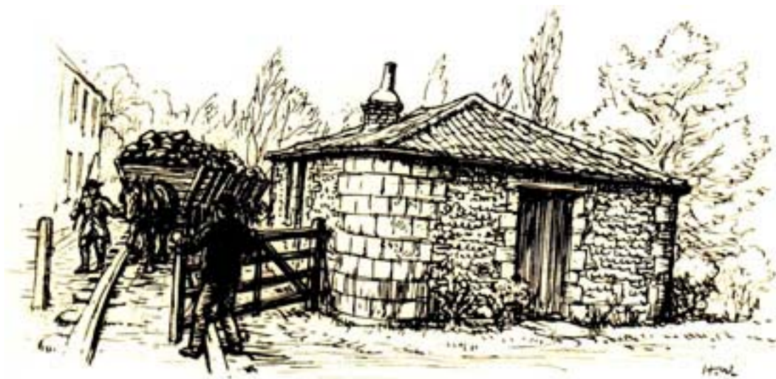
A horse-drawn cart on the Surrey Iron Railway, circa 1830.

Dairy farming and pig breeding, pigeon shooting and greyhound racing, polo ponies and trace horses, zebras and penguins, stray dogs and cats and a talking raven called “Gyp”. This exhibition is about animals and the roles they have played in local life, ranging from the everyday dependence on animals for food and transport, to their use in sport, to concern for animal welfare. The exhibition will include material on local institutions such as the Battersea Dogs & Cats Home, the Anti-Vivisection Hospital and Battersea Park Zoo as well as a competition to find the person who looks most like their pet.