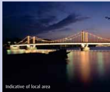
Indicative of local area