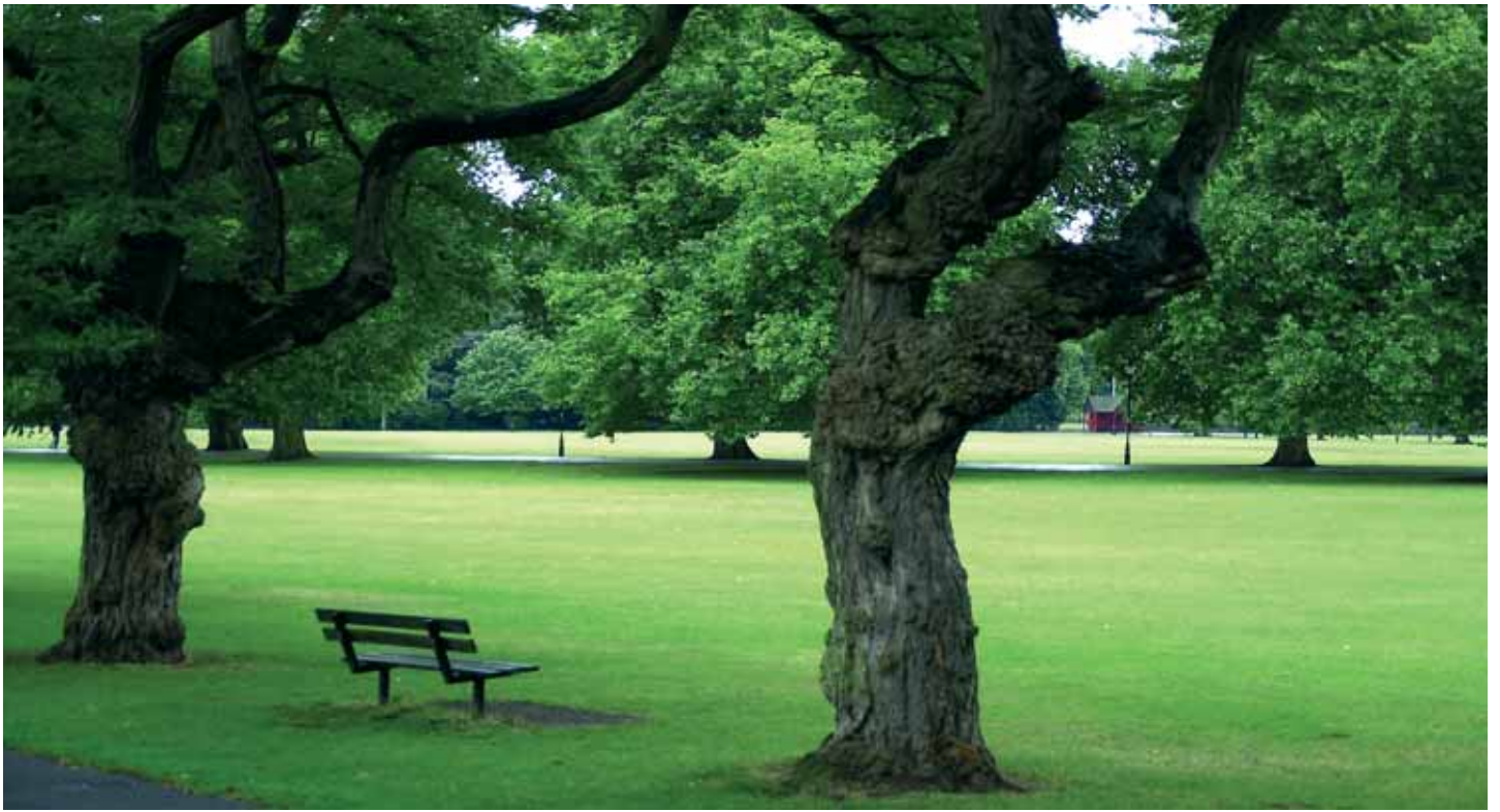
battersea park, photographed for first union by ian litter, july 2003