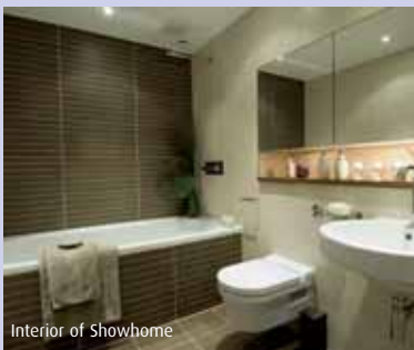
Interior of Showhome